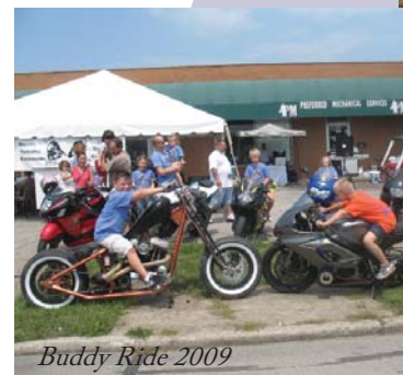
Buddy Ride 2009