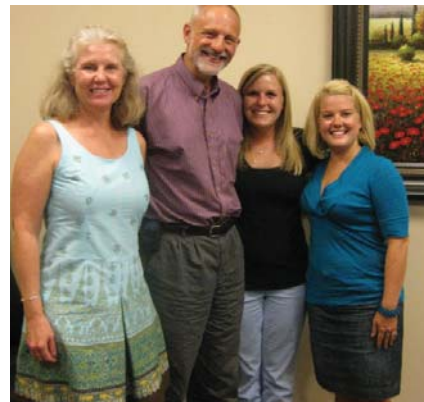
DSACK new Board Directors